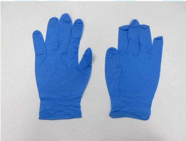
Samples described as SNAET-245B